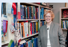
Professor takes teaching to a new level. Story on page 4.