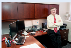
Meet ITD's Associate Vice President. Story on page 6.