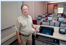
Keeping classroom technology up and running. Story on page 6.