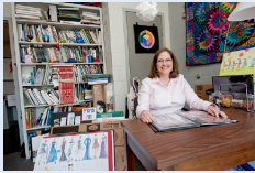
Fashion designing in the 21st century. Story on page 4.