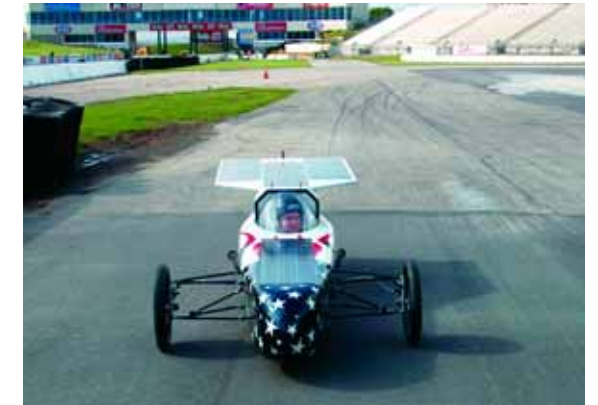
Solar vehicle teams placed first and second in 2003-04 competition.