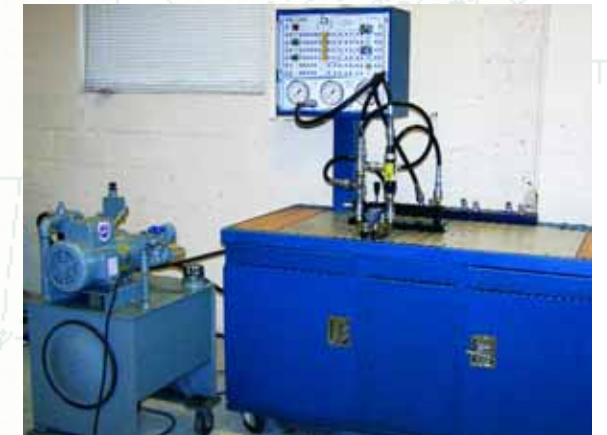
Fluid power trainer