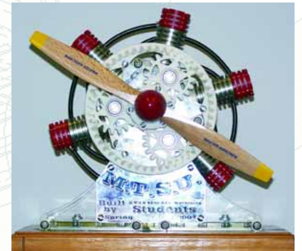
Air motor (a student project in CAD/CAM)

This group also assists students in finding internship and co-op positions and helps link local industry to student projects.