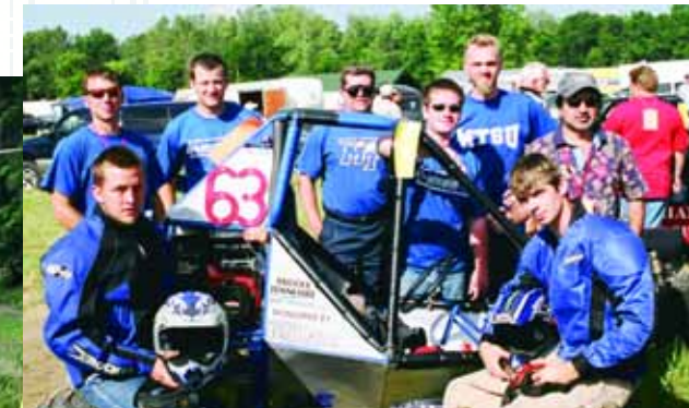
2005 Mini Baja competition

Students have the opportunity to apply classroom skills to real world projects and challenges. The program builds team, leadership, and communication skills that are necessary in the industry.