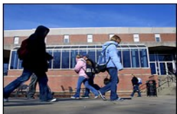
Outside the Keathley University Center

The Union acts as both a facility and a program designed to enhance campus life and advance the University's educational mission. Facilities include a ballroom, dining rooms, a movie theater, numerous meeting rooms, catering services, a bookstore, post office, a convenience store, cafeterias and student lounges. The Division of Student Affairs also operates many offices within the Union buildings including: Greek Affairs, Student Organizations, Disabled Student Services, Intercultural and Diversity Affairs, Student Government Association, Center for Women and Non-Traditional Students, Center for Student Involvement & Leadership, Career Development Center, Guidance and Testing Services, Housing, Judicial Affairs, New Student and Family Programs, Leadership and Service, Student Programming, and the Dean of Students.