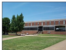
Keathley University Center