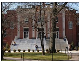
James Union Building