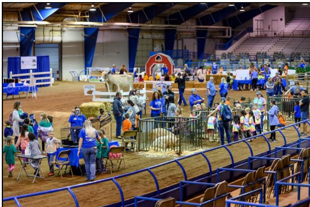
Local elementary school children experience the annual agricultural field trip, Ag Ed Spring Fling, offered for area schools.