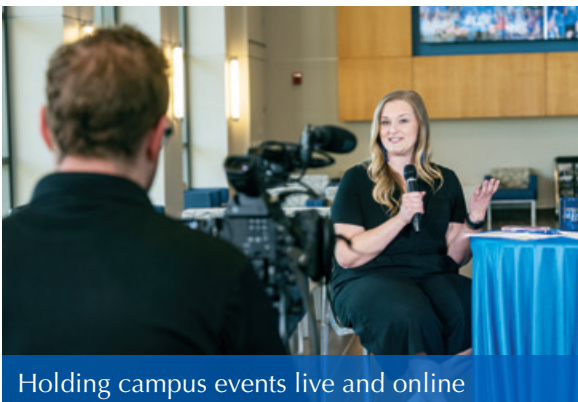
Holding campus events live and online