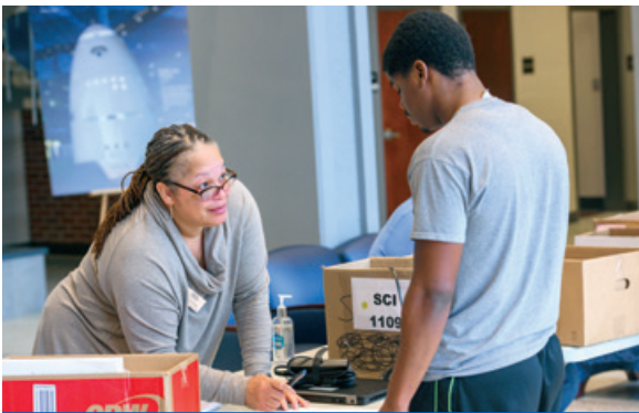
Computer and technology checkout in Cope