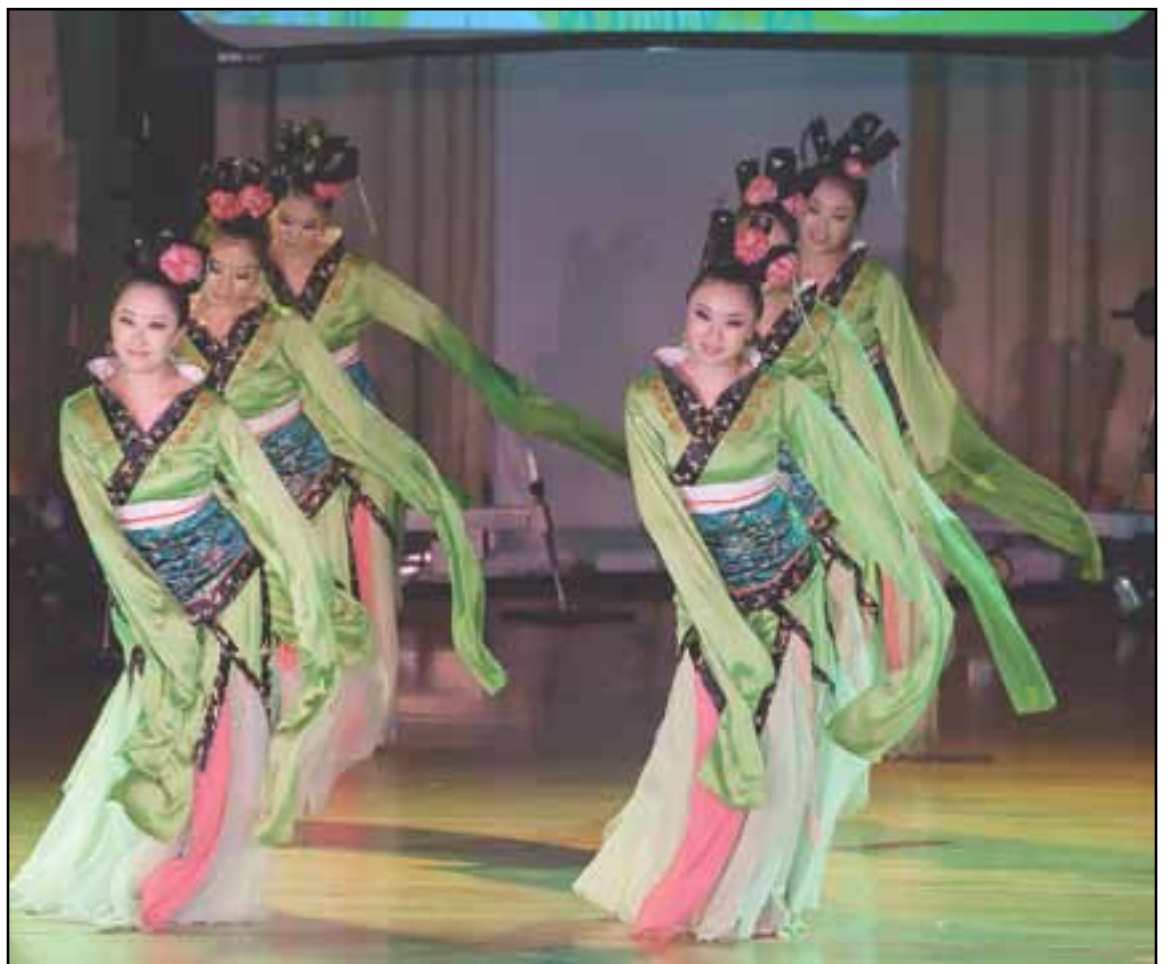
(Right) Dancers perform "Spring Outing," a classic Chinese dance incorporating postures from the Han dynasty, during "An Oriental Monsoon."