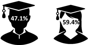
6-Year Graduation Rate by Gender

For New Full-time Degree-Seeking Freshmen (2019 Cohort)